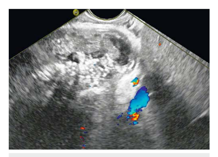
▶ Fig. 1 Endoscopic ultrasound image of gallbladder with marked wall thickness, and with the Doppler signal clearly detecting the site of vascular structures.

M, male; F, female; ASA, American Society of Anesthesiologists.