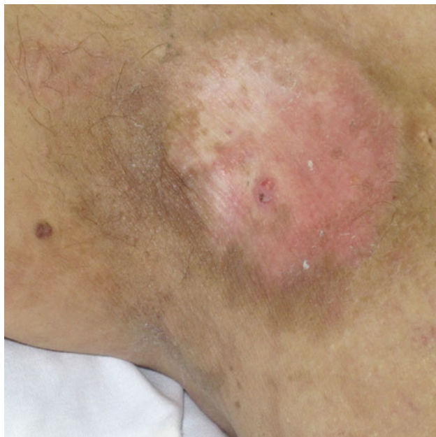
Fig. 3 Further improvement in appearance of the skin lesion 5 months after the end of treatment

could be achieved through the use of macrocomplexes—liposomes and albumin nanoparticles—measuring 150–200 nm in diameter, because of the tumor's substantial vascular network. In this setting, the so-called enhanced permeability and retention (EPR) effect occurs, whereby macrocomplexes pass through the discontinuous endothelium of tumor capillaries and maintain prolonged contact with the tumor cells because of the lack of effective lymphatic drainage toward the general circulation [9, 10]. This leads to high tumor exposure to the drugs with reduced systemic exposure. Liposome-encapsulated doxorubicin differs from conventional doxorubicin in its pharmacokinetic and therapeutic behavior. In practice, liposomes can be considered as a transport system which allows release of doxorubicin where greater vascular permeability occurs. Paclitaxel in albumin nanoparticles exploits the same transport mechanism, with the added advantage that albumin is used for tumor growth, representing the main source of energy for tumor cells. Once the cell membrane has been