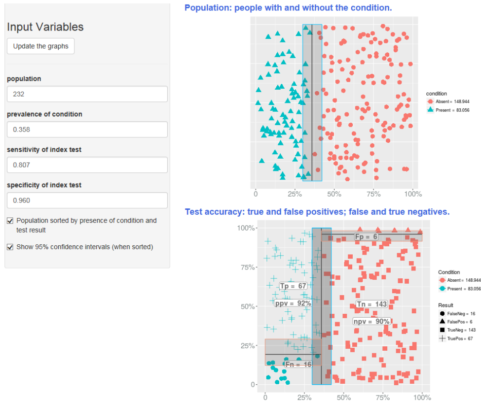
Figure 1 Screenshot from the ‘Test Accuracy’ tool, giving a graphical representation of parameters relating to diagnostic performance. FN, false negative; NPV, negative predictive value; PPV, positive predictive value; TN, true negative; TP, true positive.

interpretation and application of the results. Example scenarios include those in which predictive values are not provided directly, but can be inferred from sensitivity, specificity and prevalence information, and situations in which the prevalence of the condition varies. They could also be useful for authors of systematic reviews of diagnostic test accuracy studies to derive predictive values from sensitivity and specificity values. They have value in designing new studies, for which preliminary estimates of predictive values and their CIs are useful in helping to choose appropriate and ethical sample sizes. The tool quickly allows users to assess the impact of different sample size and prevalence