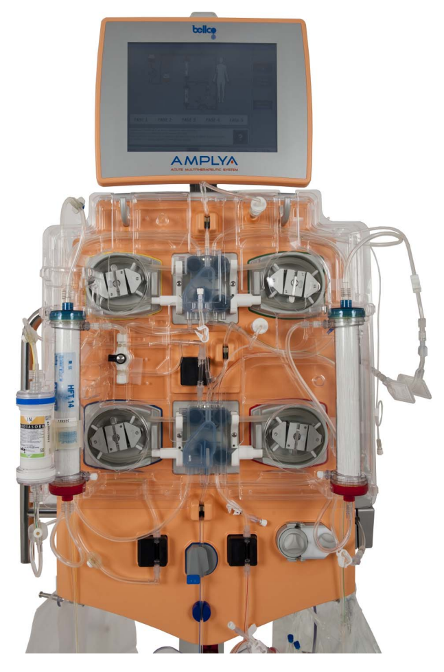
Figure 1 AMPLYA system from Bellco Societa unipersonales a r.l. The resin cartridge and plasma filter are in position and ready for use. The copyright holder (Bellco) has approved the usage of this figure.

CPFA was first used in the late 1990s with subsequent publications of several small observational clinical reports and case studies.<sup>20–26</sup> A few years ago, a large randomised multicentre controlled trial was performed by a group of Italian intensive care physicians, GiViTI, but the trial was stopped for futility.<sup>27</sup> Factors leading to early stopping were extensively analysed by the investigators and focused primarily on technical problems and the inability to achieve an appropriate dose of treated