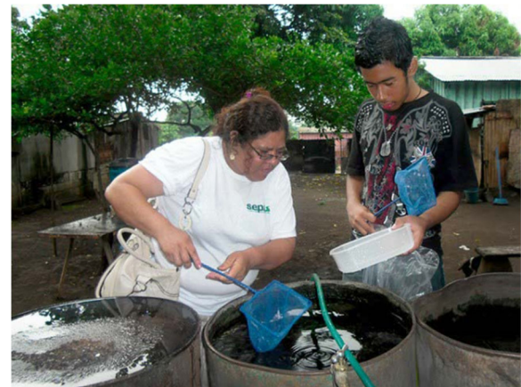
Fig. 1 Brigadista demonstrating to a householder in Nicaragua the presence of larvae in his own water storage barrel.

One piece of evidence was lurking in each household's own water containers. During the household visits, brigadistas would accompany the household head, and often the children, on an inspection of the various water receptacles on their property. Finding mosquito larvae and/or pupae right on the premises offered a unique opportunity for making people aware of their presence and discussing ways of preventing them from maturing and/or from ever being there in the first place (Fig. 1). Rather than prescribe ways of doing this, brigadistas discussed various solutions with residents and encouraged them to be creative in seeking solutions. It was out of such dialogues that residents in Mexico brought up the tradition of using fish for biological control of mosquito larvae [50]. In Nicaragua, the idea of producing elasticized barrel covers emerged from such discussions. Thus, evidence from the baseline survey was used to launch the intervention.