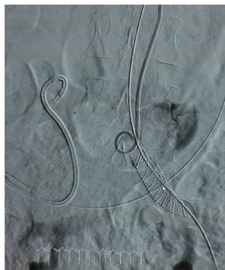
Figure 2. Arteriographic aspect after stent graft stenting of left CIA.