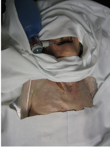
FIGURE 3: Lightly-embalmed cadaver training model.