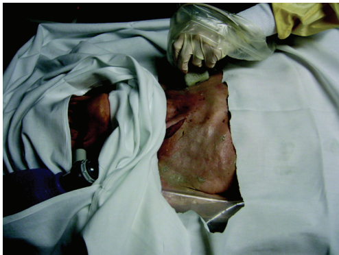
FIGURE 4: Probe placement on cadaver training model to detect a pneumothorax.

seconds, and the average time to complete the M-mode scan was 22 seconds.