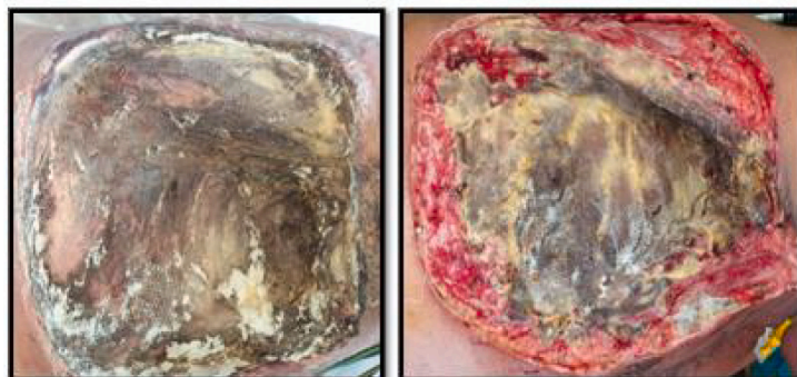
2(a): (Post 48hrs of First Debridement)