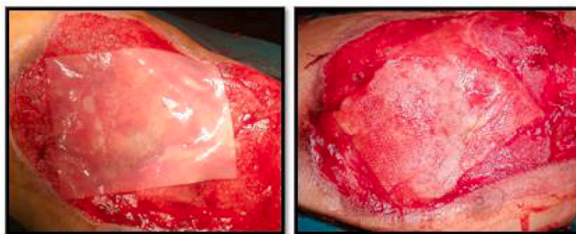
5(a): Meshed IDRT (4x5 inch)