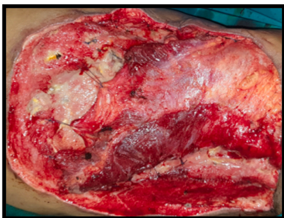
Fig. 4. Sixth debridement with local latissimus dorsi flap.

adequate hydration to prevent renal injury along with supportive management, good nutrition and physiotherapy. NPWT was done repeatedly every fifth day in operation theatre for examination under sterile condition, proper saline wash and ruling out subdermal collection. A good uptake of dermal matrix on Day 15 without any collection