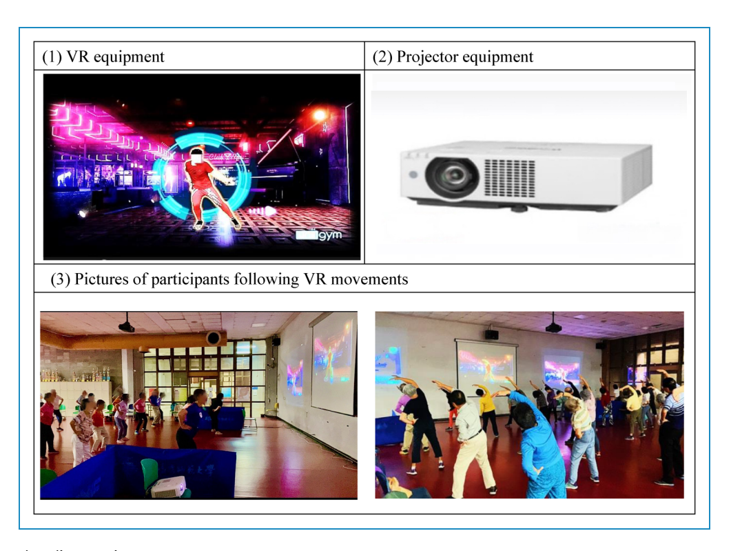
Figure 2. Virtual reality exercise.

with cardiorespiratory fitness, comprising aerobic dance and boxing (i.e., frequent changes in hand and foot movements) at various paces and in different coordination modes based on the style of the video. Each video lasted approximately 55–60 min. A total of 12 consecutive weeks of exercise sessions (75–90 min per session, twice a week) were performed by the experimental group. The VR exercises commenced at beginner level and were subsequently upgraded to the intermediate level; moreover, they were administered by the research assistant based on participant status and ability.