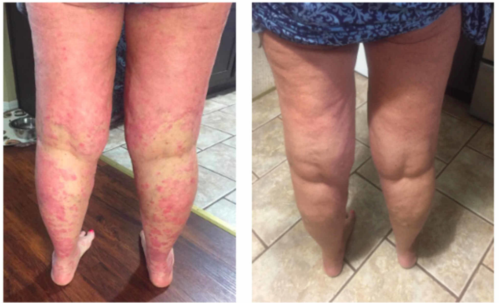
FIGURE 2: Before and after photos following treatment with secukinumab