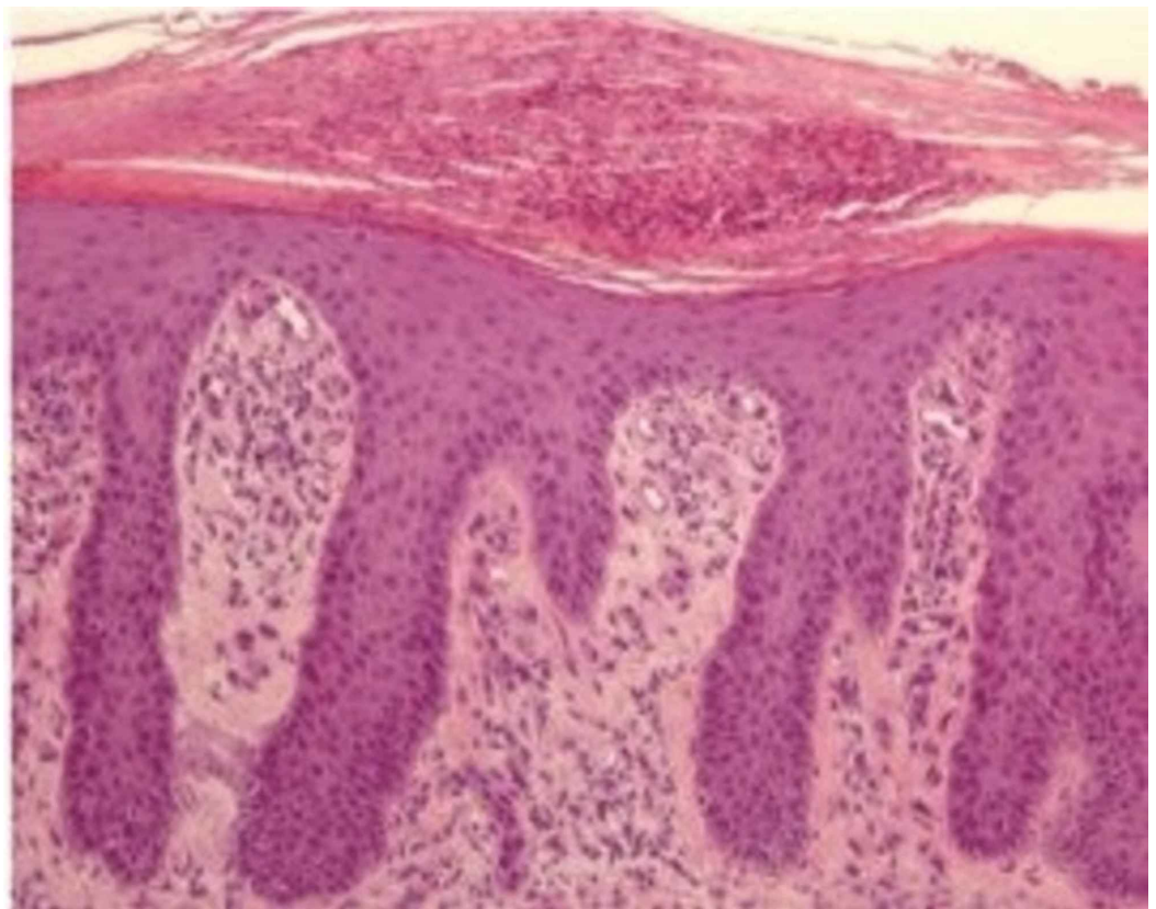
FIGURE 1: Histopathology of skin lesions using hematoxylin and eosin staining (approximate magnification 200x) consistent with psoriasis

Prior to the initiation of immunotherapy with pembrolizumab 200 mg intravenous (IV) every three weeks, the patient had no active psoriatic lesions and had been in spontaneous remission of her psoriasis for the past couple of years. However, three months following immunotherapy, the patient developed diffuse dermatitis on her left ventral proximal forearm, anterior proximal thigh, arms, legs, and trunk. The patient was referred to dermatology, and a shave biopsy was performed. Pathology showed severe plaque psoriasis, most probably induced by pembrolizumab (Figure 1). She was started on 0.05% clobetasol propionate cream but failed to respond to treatment after four weeks. Computed tomography (CT) of the chest, abdomen, and pelvis showed no findings of recurrence or metastatic disease in the chest. Following a negative hepatitis panel and interferon-gamma release assay, the patient was commenced on secukinumab and, gradually, the patient's psoriasis was ameliorated. Given the clinical response to secukinumab for psoriasis, pembrolizumab was continued without further complications (Figure 2).