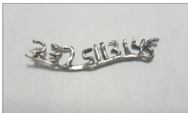
Figure 3: Finished and polished cast metal individual national identification number