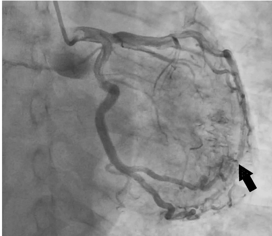
FIGURE 2: Another view of the left coronary angiogram re-demonstrating the fistula between the first obtuse marginal branch of the left circumflex artery and LV.