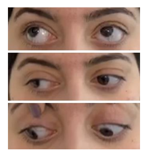
Fig. 3. Left eye adduction deficit.

Arnon et al.: A Case of Ocular Myasthenia Gravis with Severe Blepharitis and Ocular Surface Disease