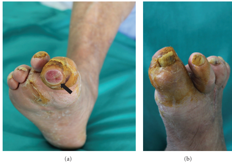
FIGURE 1: Photographs of dorsal (a) and plantar (b) ischemic toes of the right foot; the I toe presented an ulceration located at the extremity (arrow). Previous amputation of the III toe is also evident.