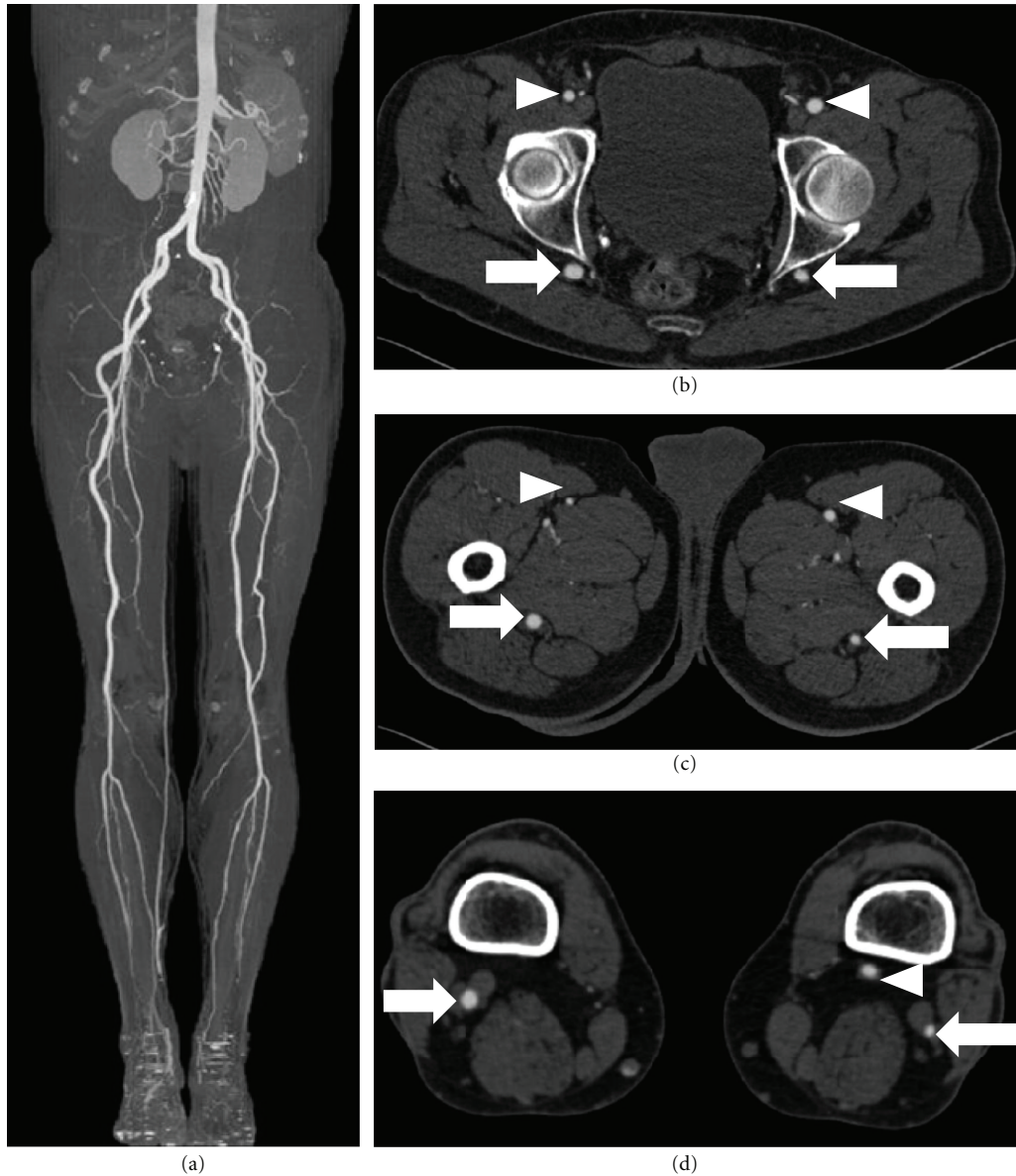
FIGURE 4: (a) Maximum intensity projection reconstruction on a coronal plane with bone subtraction technique. No severe signs of atherosclerosis were depicted in the whole peripheral circulation. ((b), (c), (d)) Multiplanar reconstructions on axial plane show, respectively, the course of the sciatic artery (arrows) and that of femoral arteries (arrowheads).

completely known, there may be mechanical (traumatic) and intrinsic causes [9]; hypoplasia of the elastic components may be an important factor of this wall degeneration [10].