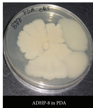
FIGURE 2: Incubation of ADHP-8 in potato dextrose agar (PDA).

The level of microbial contamination is mentioned in different standards for publication including EP, USP, and WHO guideline to maintain the safety of herbal preparations (Table 3). Gram negative bacteria such as Salmonella , Shigella , and E. coli should be absent in the preparation. Moreover, the limit for coliforms is also mentioned, as it is the most reliable indicator of faecal contamination, which may indicate the possible presence of other harmful disease-causing organisms. The presence of fungi in herbal preparations under certain conditions may lead to the secretion of toxic metabolites such as mycotoxins, which when ingested, inhaled, or absorbed through the skin cause illness or human and animal death [22]. These mycotoxins possess substantial risk of carcinogenic, neurotoxic, immunotoxic, and mutagenic effects [11–16]. It is reported that a substantial amount of medicinal plants is contaminated naturally by fungi from soil and environment and thereby may contain mycotoxins [10]. As most of the herbal preparation majorly contains medicinal plants, it is important to assure that the levels of mycotoxins