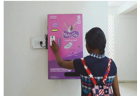
FIGURE 2: Sanitary napkin vending machine.

water pollution and to fasten the decomposition process.