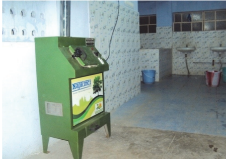
FIGURE 3: Incinerator installed in the toilet for easy sanitary products disposal.

have made for solid or biomedical wastes. Appropriate policy and legal framework is necessary for the management of menstrual wastes.