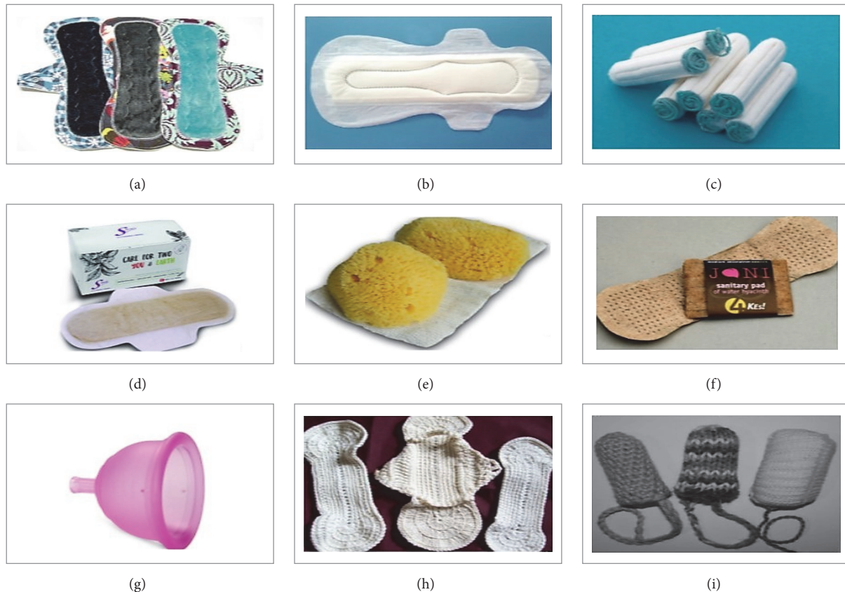
FIGURE 1: Types of sanitary products used by women during menstruation are (a) reusable cloth pads ( https://www.etsy.com/market/cloth-menstrual_pads ); (b) commercial sanitary pads ( http://topyaps.com/things-girl-must-know-about-sanitary-pads ); (c) tampons ( http://www.womensvoices.org/tag/tampons/ ); (d) pads made from banana fibre ( https://saathipads.com/ ); (e) sea sponges used as sanitary material ( https://www.pinterest.com/pin/194640015120225878/ ); (f) pads made up of water hyacinth ( https://www.ecouterre.com/jani-a-biodegradable-sanitary-napkin-made-from-water-hyacinth/ ); (g) menstrual cup ( http://rubycup.com/blog/how-to-clean-the-suction-holes-of-your-menstrual-cup/ ); (h) pads made from wool ( https://www.pinterest.com/pin/198088083583361670/ ); (i) reusable tampons ( http://natural-parentsnetwork.com/reusable-menstrual-products/ ).

flow before it leaves the body. They are expensive, not easily degradable in nature and, hence, not very environmental friendly. Nowadays, sea sponge tampons are available in the market which are a natural alternative to synthetic tampons.