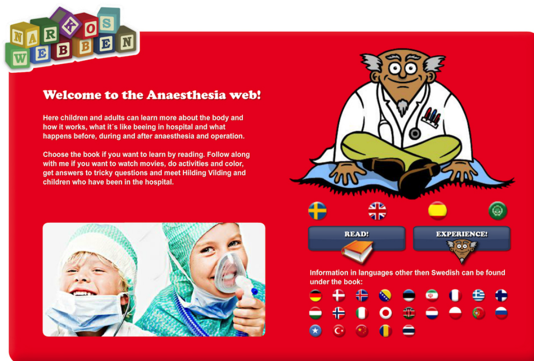
Figure 1. The front page of the Anaesthesia-Web website.

Anaesthesia-Web (Figure 1) represents a comprehensive, interactive, age-appropriate, multimedia, Web-based portal to prepare and educate children and families prior to contact with the health care system. On Anaesthesia-Web, children can learn about the body and how it works; what it is like to be hospitalized; and what happens before, during, and after anaesthesia and surgery.