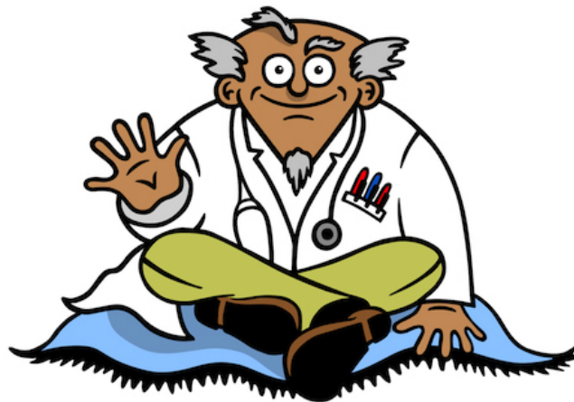
Figure 3. The curious spy-scout Hilding Vilding helps visitors to investigate the hospital on the Anaesthesia-Web. Copyright: Tintin Timén and Stefan Wahlberg.

Figure 2. Doctor Safeweb is available all over the Anaesthesia-Web to guide visitors and to answer frequently asked questions. Copyright: Tintin Timén and Stefan Wahlberg.