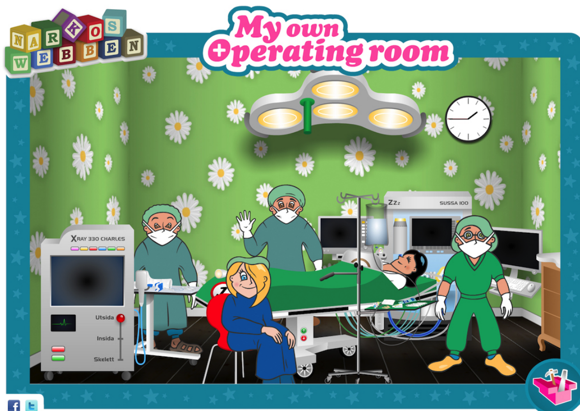
Figure 5. The Anaesthesia-Web's "My own operating room" gives children the opportunity to play and explore what it is like to be in an authentic hospital situation.

In "My own Operating Room," children can decorate and furnish an operating room to their taste. They might want the operating room to have flowered walls and grass on the floor, with a pink operating table with comfortable pillows or a table that looks like a space rocket. They can also try various technical functions such as using different monitors or operating the suction, surgical lights, and tables. Anaesthesia-Web's main characters Doctor Safeweb and Hilding Vilding play significant roles in stimulating children's motivation for learning. Hilding Vilding is filled with questions and does not stop asking them until he has found the answers. With the answers on hand, Hilding Vilding is a master at explaining difficult and complex things in an easy and understandable way. Children can follow Hilding Vilding through an exciting adventure inside the body, playing and learning from his coloring and craft book (Figure 6).