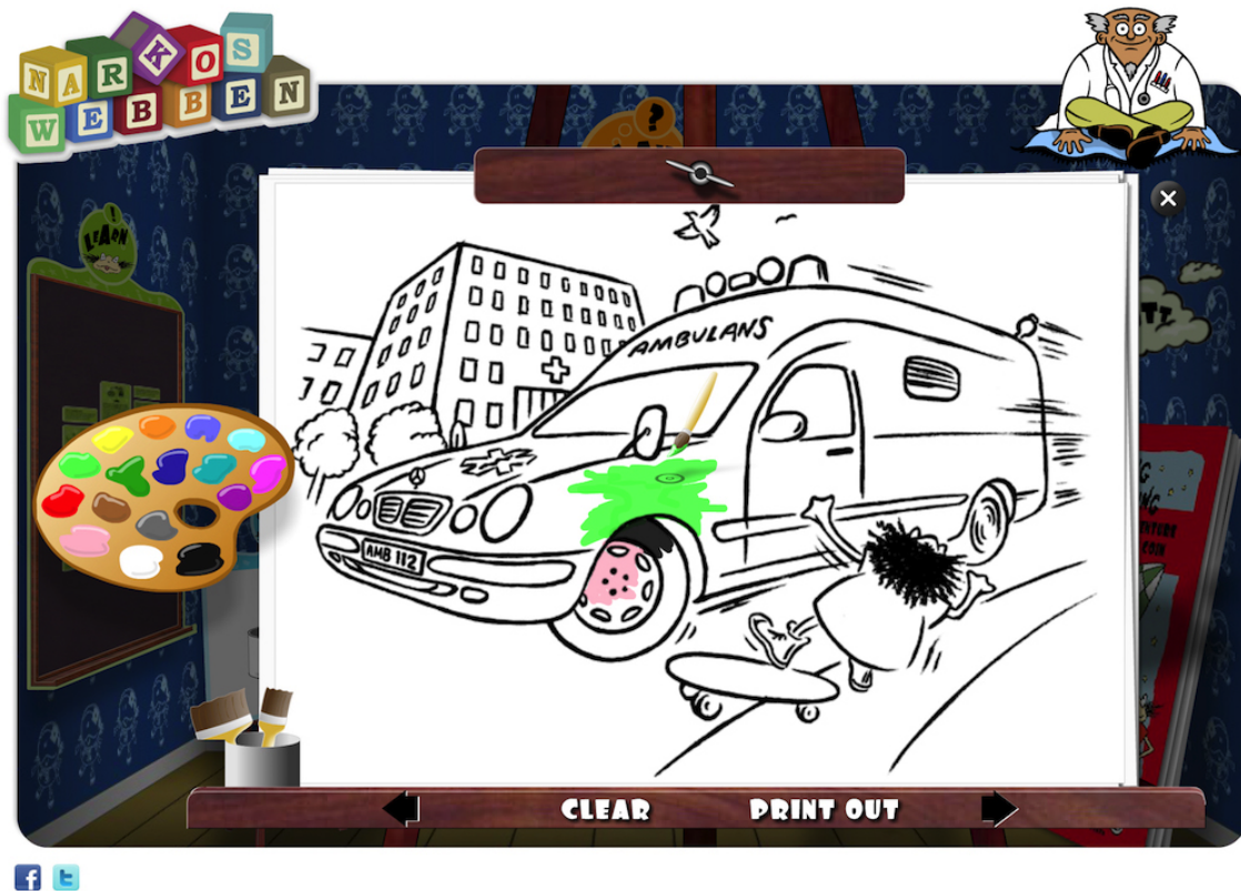
Figure 6. Children can play and learn from Hilding Vilding's coloring and craft book on the Anaesthesia-Web.

The diversity of characters available on Anaesthesia-Web offers children with different backgrounds the possibility to find someone with similar experiences they can recognize and identify with. The content on Anaesthesia-Web is nontime sensitive and without time-dependent factors such as hairstyles, clothing, and accessories. Characters and their appearance are neutralized and deidentified. A number of characters consist of sick animals and teddy bears undergoing examination and treatments (Figure 7). Toddlers can identify with cuddly toys, and the information for school children is adapted for this age group's curiosity. Adolescents can gain information from others who have blogged about their experiences while hospitalized.