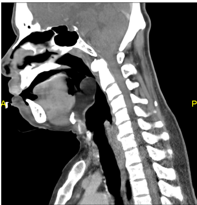
Figure 2. The same lesion as it appears on sagittal reformatted image. It is broad-based, attached to the lingual surface of the epiglottis and free from the base of the tongue.

Even though they are benign lesions, they can be life-threatening owing to their location. Morphologically, oral lipomas may be sessile or pedunculated, and thus can present with different symptoms. A few cases of pedunculated lipoma at the epiglottis, posterior cricoid and aryepiglottic fold causing laryngeal obstruction leading to death have been reported. 7 Otherwise, the