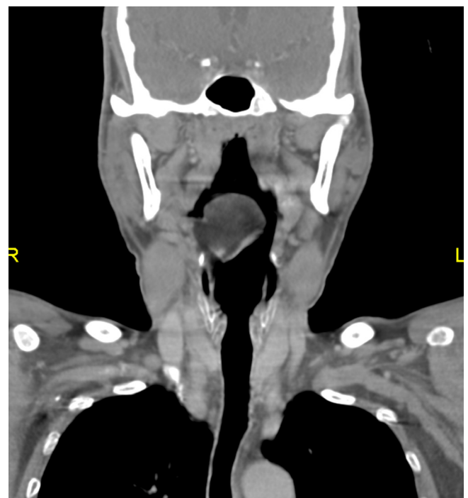
Figure 3. The same lesion on coronal reformatted image showing narrowing of the oropharynx. The hypopharynx is still spacious.

Even though they are benign lesions, they can be life-threatening owing to their location. Morphologically, oral lipomas may be sessile or pedunculated, and thus can present with different symptoms. A few cases of pedunculated lipoma at the epiglottis, posterior cricoid and aryepiglottic fold causing laryngeal obstruction leading to death have been reported. 7 Otherwise, the