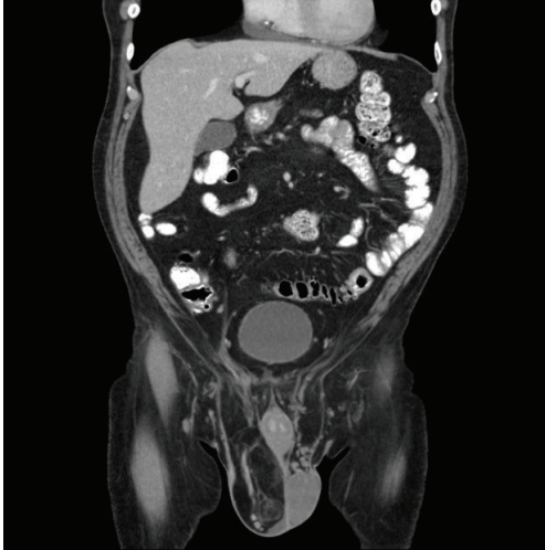
FIGURE 1: CT abdomen/pelvis read as a large fat-containing inguinal hernia present on the right side extending into the scrotal sac. No bowel loops are contained but there is a significant amount of omentum and fat present.