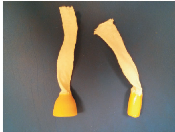
Figure 1. The Coloplast anal plug.

Two studies have compared the use of anal plugs with standard treatment [25, 26]. In both studies, patients were allowed to choose between smaller or larger Coloplast plugs. Anal continence was achieved in 37% of the plug group and in none of the control group, although there was relatively poor compliance concerning plug use. In general, patients achieving anal continence reported greater satisfaction with treatment when using a plug than when not. In another similar study, the polyurethane anal plug (Conveen®: Coloplast) was found to be more useful than a