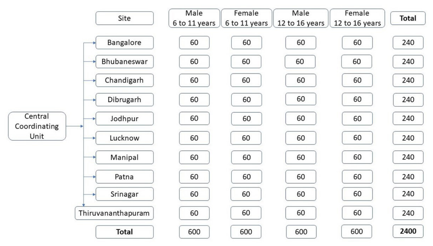
Figure 1 Distribution of participants based on gender and age group across 10 study sites.