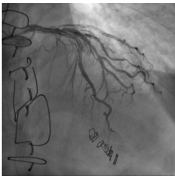
Fig. 1 Postoperative imaging shows staples in place after repair of a penetrating cardiac injury with patent coronary arteries (patient 1)

A 20-year-old female automobile driver was injured in a collision with a truck. She presented alert and oriented (GCS15 (E4V5M6)) with hypotension (BP 100/70 mmHg,