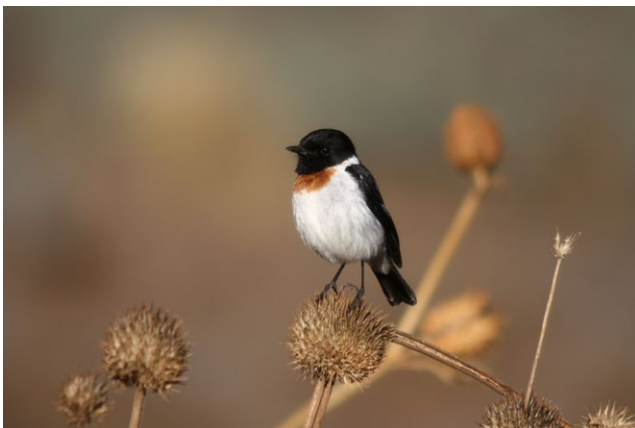
FIGURE 1 Adult male African stonechat

Here, we compare telomere length of two closely related sister taxa of stonechats, Saxicola torquatus axillaris (Figure 1) and Saxicola rubicola that breed in tropical and temperate environments, respectively (Doren et al., 2017; Urquhart, 2002). At all latitudes, stonechats are socially monogamous, open habitat, insectivorous passerines that aggressively defend breeding territories (Apfelbeck, Mortega, Flinks, Illera, & Helm, 2017). However, they vary in pace of life according to their environment (Ricklefs & Wikelski, 2002). Stonechats show a latitudinal cline in metabolic rate, with genetically inherited, higher metabolic rates in higher-latitude populations (Klaassen, 1995; Tieleman et al., 2009; Versteegh, Schwabl, Jaquier, & Tieleman, 2012; Wikelski, Spinney, Schelsky, Scheuerlein, & Gwinner, 2003). Further, temperate stonechats have a genetically fixed larger clutch size than tropical ones (Gwinner, König, & Haley, 1995), and their higher fecundity correlates with elevated baseline corticosterone concentrations during the breeding season (Apfelbeck, Helm, et al., 2017). In agreement with lower adult extrinsic mortality in tropical environments, local survival of tropical stonechats appears to be much higher than that of temperate