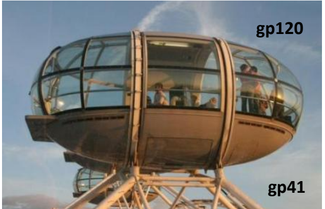
Figure 1. The London Eye as a 'model' of HIV. (a) The model depicts the diploid RNA genome and the outer envelope of the HIV particle composed of a lipid bilayer studded with glycoprotein spikes. (b) Close-up of trimeric spike showing globular gp120 and transmembrane gp41.