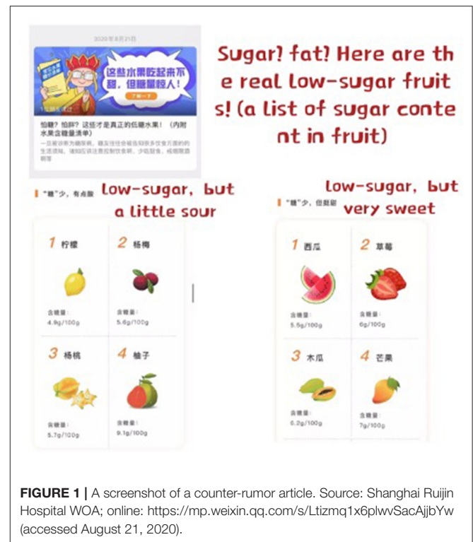
FIGURE 1 | A screenshot of a counter-rumor article.

The odds ratio (OR) and its 95% confidence interval (CI) were calculated to determine the association of risk factors with nutrition and diet knowledge. Variables with p < 0.5 in the univariate analyses were then included in a multivariate regression model to identify the independent risk factors via backward elimination analysis. The variables included in the multivariable logistic regression analysis were included as categorized variables. A test level of \alpha = 0.05 and p < 0.05 was considered statistically significant.