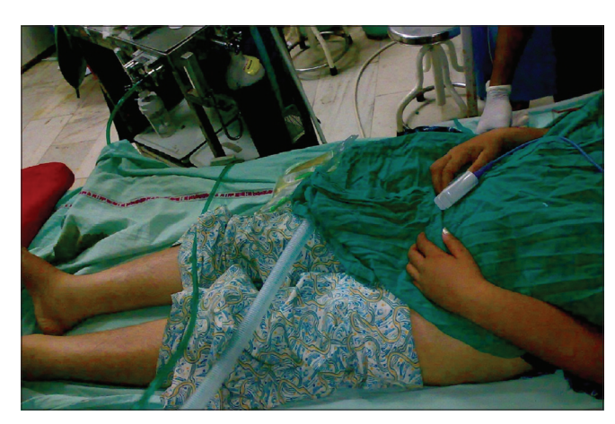
Figure 1: Photograph of the patient

UEDVT is a condition characterized by thrombosis of deep veins of upper extremity. UEDVT is classified as primary or secondary depending on the predisposing risk factors like use of central venous catheter. Primary UEDVT is a rare disorder (2 per 1,00,000 persons per year)<sup>[3]</sup> that refers either to effort thrombosis or idiopathic UEDVT. The term Paget-Schroetter syndrome was first used by Hughes in 1949 to recognize the cases of upper