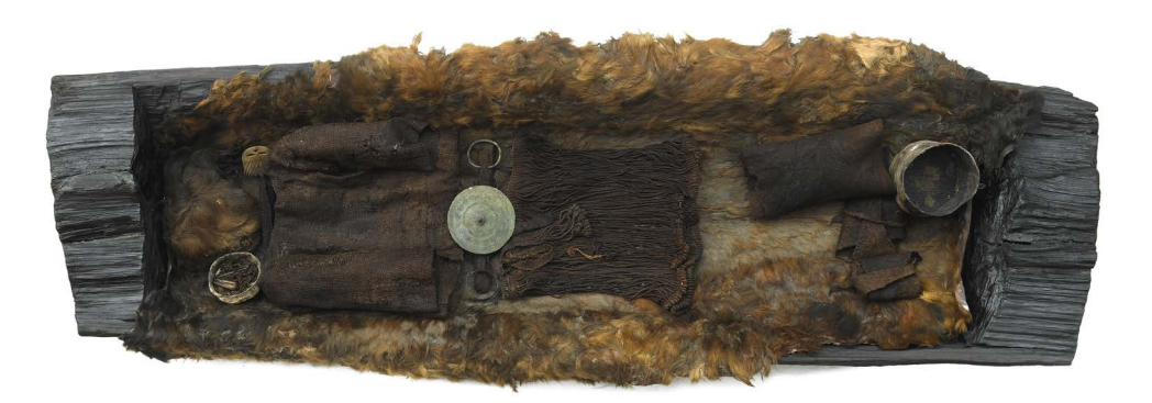
Figure 2. A photo of the remains of a Bronze Age high status female found inside an oak-coffin in a monumental burial barrow at Egtved, Denmark. The Egtved Girl's garments are extremely well preserved and her exceptional wool costume consists of several wool textile pieces as well as a disc-shaped bronze belt plate, symbolizing the sun.