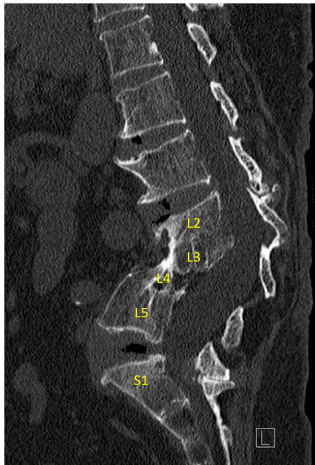
FIG. 1. Preoperative sagittal CT of the lumbar spine without contrast shows multilevel spondylosis as well as severe deformity of the lumbar spine predominately involving acute kyphosis of L2-5, deformity of vertebral bodies, and osseous bony bridging, likely secondary to reported history of Pott's disease.

Lumbar spine computed tomography (CT) and magnetic resonance imaging (MRI) on initial presentation showed profound degenerative disc disease and facet arthropathy at L5-S1 causing severe central and foraminal stenosis (Figs. 1 and 2). There was a chronic finding of autofusion of L2-5 resulting in a fixed kyphotic deformity with almost complete destruction of L3 and L4. Scoliosis films showed a fixed kyphotic deformity that was unchanged in the standing and supine positions (Fig. 3A). PI was 40°, suggesting ideal LL to be 40°. Lumbar angulation was 24.4° in kyphosis, indicating 64.4° of correction necessary. Sacral slope was low and PT was 30.9°, which indicated significant retroversion of the pelvis to stand upright. Because of poor response to noninvasive therapies and progression of symptoms, the patient agreed to surgical intervention. Her vascular anatomy on the ventral surface of the spine was tortuous, with an area of redundancy to the aorta due to severe