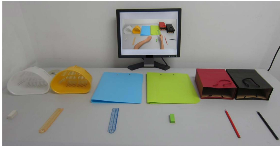
Figure 3. Illustration of task set-up during the demonstration condition.