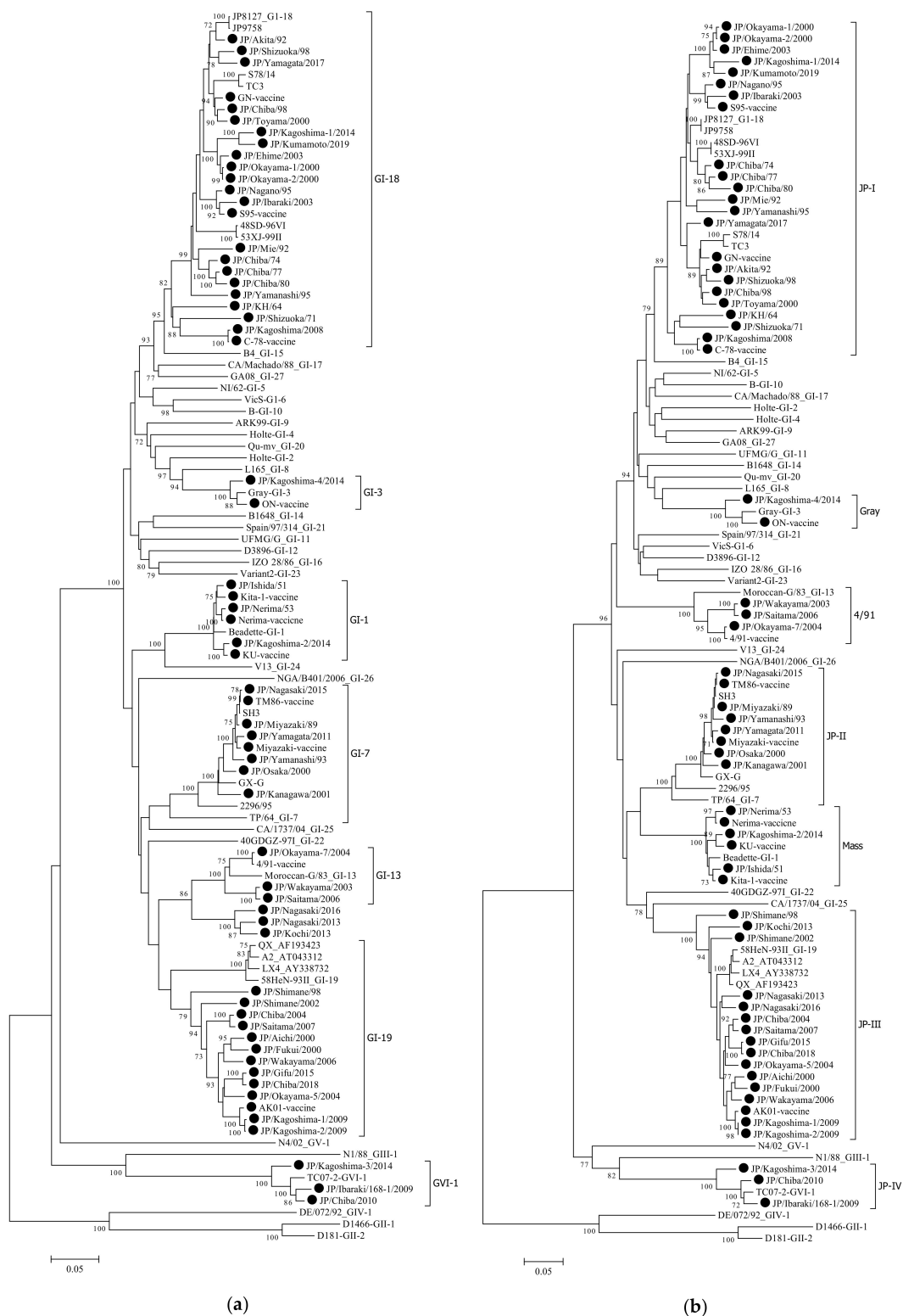
Figure 1. Phylogenetic trees that are based on the complete (a) and partial (b) S1 glycoprotein gene of the infectious bronchitis virus (IBV), strain Beaudette (GI-1, GenBank Accession No. NC001451). For (a,b), nucleotides 20368–21978 (1632 bases) and nucleotides 20368–20988 (621 bases), respectively, were subjected to phylogenetic analysis. Subsequently, both trees were generated using the neighbor-joining method in MEGA 7 [15] with 1000 bootstrap replications. All tools were run with the default parameters unless otherwise specified. Then, horizontal distances were proportionally set to the minimum number of nucleotide differences that were required to join nodes and sequences. The IBV genotypes were defined as described previously [10].