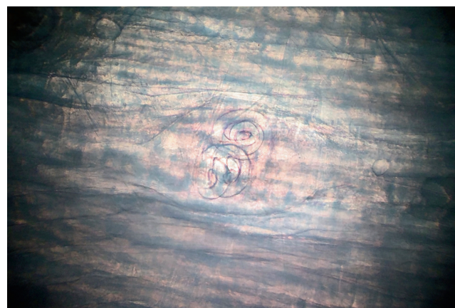
Figure 2. Nurse cell ( Sus scrofa , diaphragmatic muscle biopsy, unfixed, unstained tissues, contrast-enhanced optical microscopy). Myocyte infected with 2 spiralized Trichinella spp. L1 larvae. Myocytes infected with intrazoic larval forms presented cytomorphometric modifications compared with the normal ones. In particular, an increase in myocyte's transverse diameter was observed. A capsule defines limits between the larval vacuolar compartment and myocyte's extracapsular sarcoplasm, originating the structural and functional wall of the nurse cell complex. Nurse cells mean estimated biometrics were 500 \mu\text{m} in length and 250 \mu\text{m} in height.