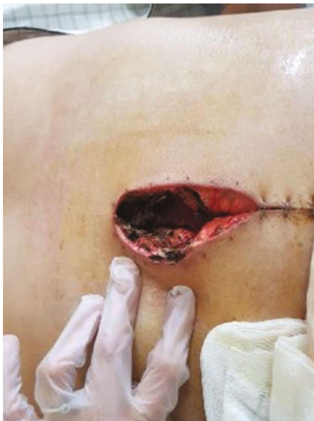
FIGURE 1: Wound appearance at the initial phase of disease (necrotic edge is seen).

Our center follows a local protocol for prophylaxis: targeted antifungal prophylaxis, preemptive therapy for Cytomegalovirus (CMV) except for high-risk patients including patients with acute liver failure, donor positive-recipient negative serology, and retransplantation that receive primary prophylaxis. We also use universal prophylaxis for Herpes virus (HSV) with acyclovir for the first 4 weeks after transplant and Pneumocystis pneumonia (PCP) with pyrimethamine-sulfadiazine for 6 months. In targeted antifungal prophylaxis, we assess the patients based on their risk factors; the high-risk patients include patients with retransplantation, reoperation within first month, and acute liver failure and those who need renal replacement therapy receive voriconazole for 4 weeks.