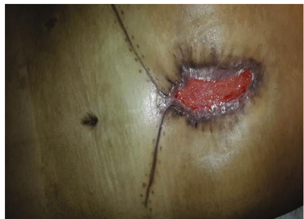
FIGURE 3: Follow-up at the time of discharge after 2 months.

The cutaneous mucormycosis typically is a rare condition; however, it has a good survival rate when diagnosed early [3, 4]. Although definite prevalence of skin mucormycosis is unknown, according to the review of previous studies, it is estimated that this disease has a prevalence of 0.43 to 1.7 per million [7]. Inhalation or inoculation of spores of Mucorales on the skin or mucous is the common transmitted pathway in humans [8]. Past reports suggested that the most frequently isolated strains of cutaneous mucormycosis are