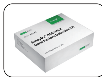
ROS1/ALK Gene Fusions Kit