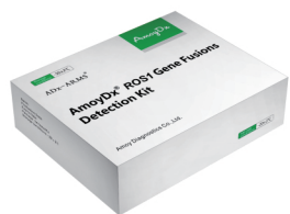
ROS1 Gene Fusions Kit