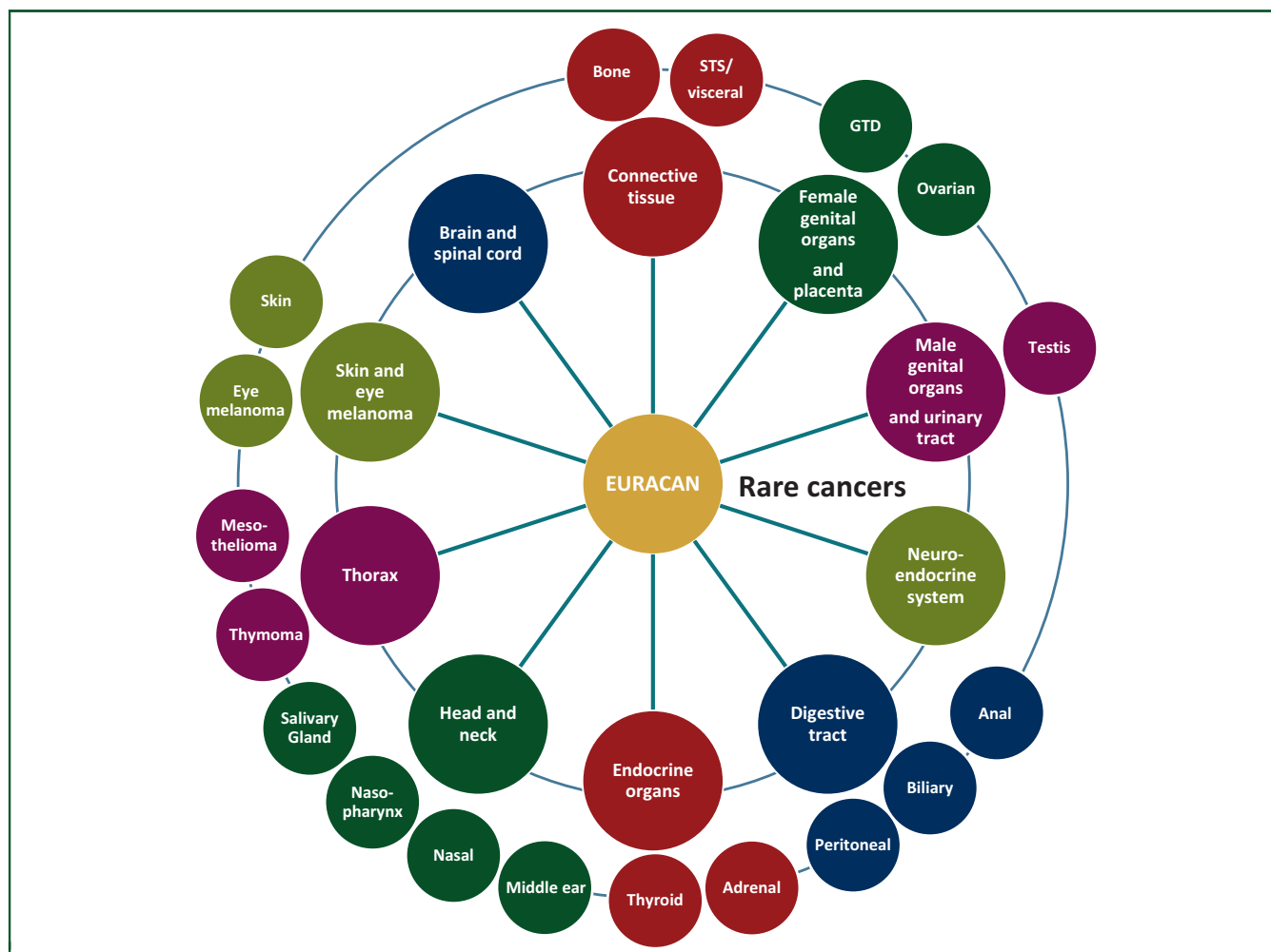
Figure 1. Rare adult cancers.