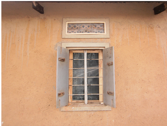
Figure 3 A window and ventilator on one of the demonstration houses with complete mosquito proofing.

the number of household members and the available functional nets at the time. Households received between two and six LLINs. These interventions were carried out after educating the beneficiaries on the importance of using the methods in the prevention of malaria. These demonstration households were important in promoting the integrated approach among the community. The interventions were not only beneficial to the members of the demonstration households but also the entire community who appreciated the integrated approach, which they had been taught during the project training. Indeed, several community members on seeing the demonstration households expressed interest to the project team in having the interventions also implemented in their houses. In addition, villages neighbouring those involved in the project requested the project team to extend the interventions to their areas. However, this was not possible mainly due to limited resources. It was the responsibility of members of