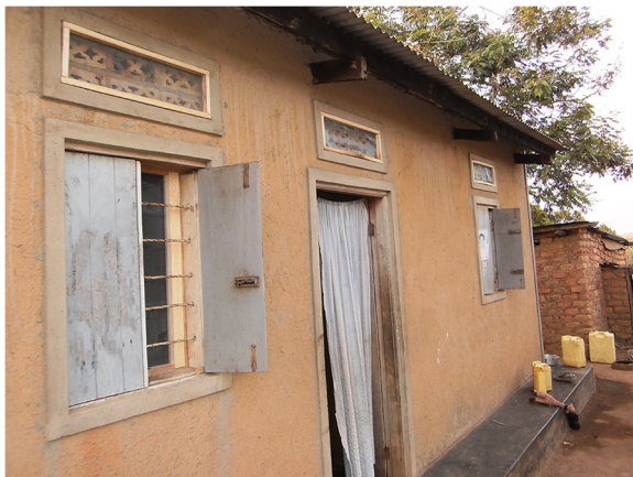
Figure 4 One of the demonstration houses with complete mosquito proofing in windows and ventilators.

the number of household members and the available functional nets at the time. Households received between two and six LLINs. These interventions were carried out after educating the beneficiaries on the importance of using the methods in the prevention of malaria. These demonstration households were important in promoting the integrated approach among the community. The interventions were not only beneficial to the members of the demonstration households but also the entire community who appreciated the integrated approach, which they had been taught during the project training. Indeed, several community members on seeing the demonstration households expressed interest to the project team in having the interventions also implemented in their houses. In addition, villages neighbouring those involved in the project requested the project team to extend the interventions to their areas. However, this was not possible mainly due to limited resources. It was the responsibility of members of