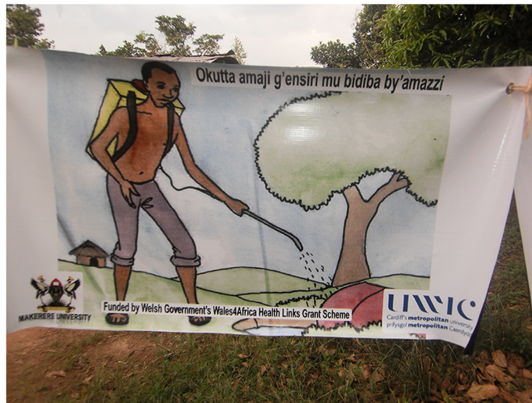
Figure 1 One of the posters used for training community health workers and sensitization.

fliers were distributed to the community after the training so as to give them out to others who did not attend. These materials were translated into the local language ( Luganda ) so as to facilitate learning among the population.