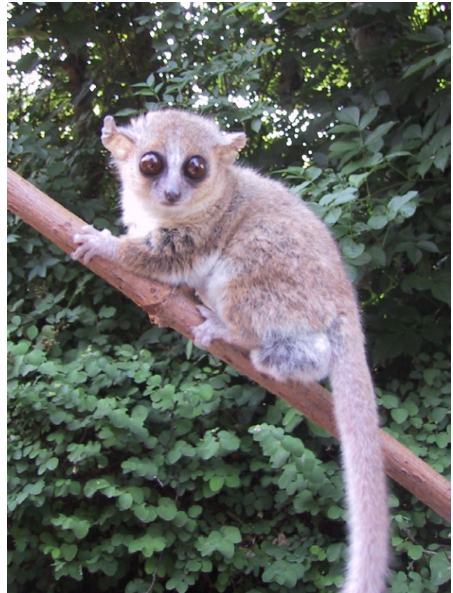
FIGURE 1 Photograph of a male gray mouse lemur in the captive colony of Brunoy

This also suggests that these two personality traits did not interact with one another. Agitation scores in mouse lemurs have previously been correlated with their response to human handling (Verdolin & Harper, 2013). In that study, the authors suggested that the agitation score may be interpreted as shyness or anxiety. In our study, mean agitation was also positively correlated with heart rate (Table S1), which could thus suggest that the agitation score was a good indicator of stress during manipulation in this species. Thus, the absence