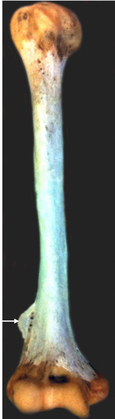
FIGURE 1: Right humerus with the lateral supracondylar process (arrow).