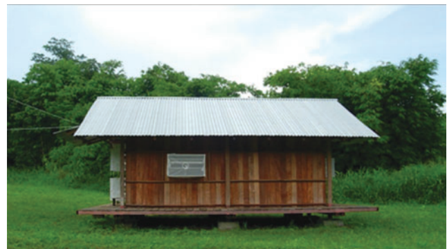
FIG. 2. Experimental hut constructed specifically to evaluate vector bionomics.

Experimental hut studies. Experimental hut studies are common tests used to validate laboratory findings of vector behavioral responses to insecticides (time and density of house entry or exit), perform small-scale field trials of interventions (IRS, LLINs), and describe natural ecology patterns of disease vectors ( e.g. , host choice; indoor vs. outdoor biting; resting preferences) both before and after treatment (World Health Organization 2006, 2009a, 2009b, 2013b, 2013c). There are two common types of experimental hut—newly constructed to serve specific study objective(s) (Fig. 2), and local housing that has already existed in the study area. In such studies, it is necessary to attract host-seeking vectors to the hut and collect them to assess the outcome of interest ( e.g. , a reduction in vector density in a treated hut compared to a control without intervention). Currently, there are no equally effective or near-equivalent substitutes for