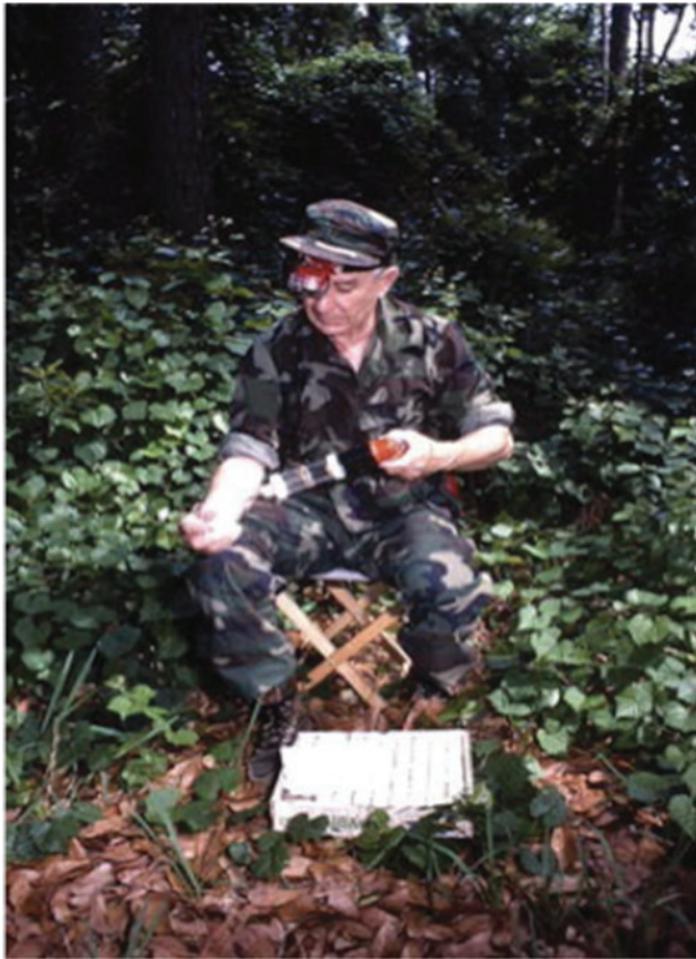
FIG. 4. Human-landing catch (HLC) technique in an outdoor setting. Mosquitoes landing on the exposed extremity (arm or leg) are collected using a battery-operated or mouth aspirator.

estimate flight distances, evaluate the efficacy of transmission control tools, such as topical repellents, bed nets, and chemical insecticides, as well as to describe vector species compositions in a particular study site. In field studies, the vectors can be further analyzed for infection rates to estimate pathogen inoculation (transmission) rates, identify and incriminate primary, secondary, and incidental vector species, determine pathogen species composition, and compare before and after intervention landing rates to monitor effectiveness of a control strategy. HLCs are employed under laboratory, semi-field, and field conditions based on research goals and therefore can vary in the risk of potential adverse effects to humans. HLCs have been most widely used for monitoring the human-biting mosquito population that is epidemiologically relevant to transmission and control of malaria, arguably the arthropod-borne disease with greatest global health burden (World Health Organization 2013a). Because HLCs provide a sensitive measurement of mosquito population presence and density, this method is expected to continue to be a vital tool in the coming years as national vector control programs shift their malaria agenda from control to elimination, which, depending on the design of the program, may suppress mosquito populations and make them more difficult to measure.