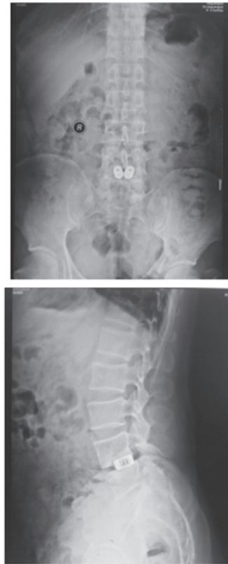
Figure 3. Images captured following bilateral vertebral lamina fenestration for lumbar interbody fusion.

patients are capable of looking after themselves in their daily life although unable to work; poor effects: patients suffer nerve compression and require further surgery. Using these criteria, in our study a total of 42 cases (87.5%) were optimal, 5 cases (10.4%) were good and 1 case (2.0%) was passable. All cases exhibited relieved lower limb pain and the back pain relief rate was 97.9%. One patient demonstrated mild cerebrospinal leakage in the incision 7 days after surgery; this healed well after local processing and the stitches were removed after 3 weeks. One type II case exhibited repeated left waist pain from six months after surgery. The 14 month post-operative X-ray radiographs suggested good interbody fusion; however, the pedicle screw system was loosened and the back pain was relieved following its removal.