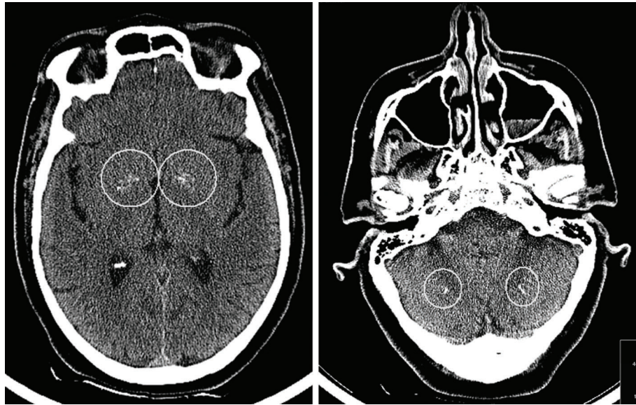
Figure 1 Axial computed tomography scans of the head showing calcifications in the globi pallidi (left) and dentate nuclei (right).

phosphatemia, resulting in psychosis, mood disorders, or both, as well as neurological manifestations. The basal ganglia play important roles in mood, cognition, motivation, and motor control; their function includes motor learning, attention allocation and filtering, and working memory. Psychotic symptoms in such cases often include auditory hallucinations, delusions of influence, paranoid states, and complex perceptual distortions. 3 Hypocalcemia also causes cognitive impairment. Neurological manifestations tend to improve with calcium correction, but psychiatric symptoms do not improve substantially. 4