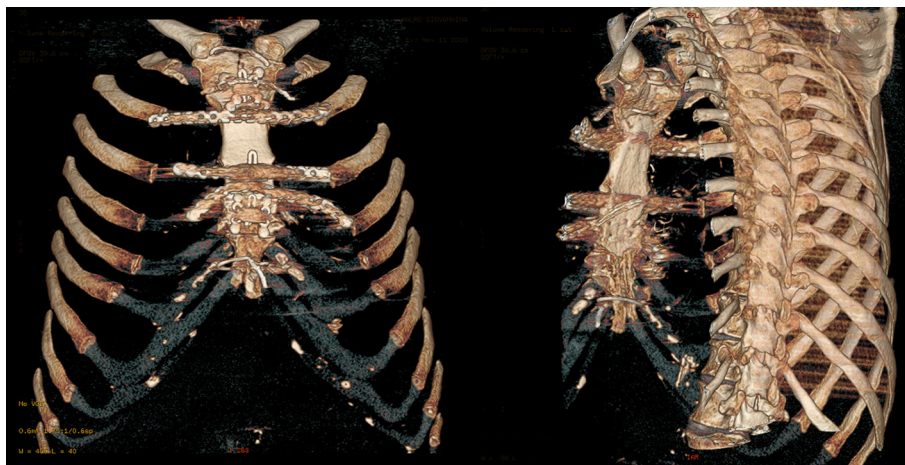
Figure 2 CT scan reconstruction 2 months after surgery. The transplanted sternum appears well integrated with the rib cage.

Following the theory of regenerative medicine, we believe bone graft is the best substitute for the resected sternum; the graft could act as a scaffold for new bone formation, mesenchymal cells could migrate into the graft and a differentiation into osteoblastic elements has been demonstrated [4]. In the case of a large graft, as sternal substitution requires, we prefer allografts to autografts in order to avoid pain and functional impairment