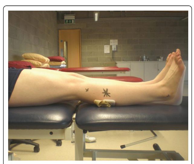
Figure 1 Scanning position . Test position with star indicating point of measurement. The lateral malleolus and head of fibula can also be seen marked with an 'x'.

A Esaote Aquila ultrasound scanner (Pie Medical, Maastricht, The Netherlands) with an 8 MHz linear array transducer (Esaote Europe, The Netherlands; 40 mm footprint) was used for measuring both the left and right anterior tibial muscle groups. Measurements were taken in both transverse and longitudinal directions. The testing positioning and procedure used was based on previous research measuring anterior tibial muscle size using real-time ultrasound imaging [7]. Subjects were positioned in long sitting on a plinth, with the hip in 90 degrees flexion, the knee extended and the ankle resting in zero degrees in an ankle foot orthosis (AFO). The subjects wore shorts in order to leave the lower limbs exposed. Scans were taken at a point 20% of the distance from the head of fibula to the tip of the lateral malleolus. The distance was measured using a measuring tape. This point was then marked on the subject's leg (Figure 1).