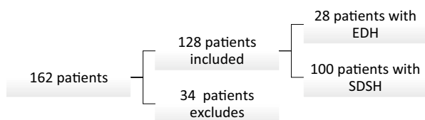
Fig. 1 Patients inclusion scheme

The factors that entered the model and had a significant relationship with the mortality rate at the level of p < 0.05 were: the initial GCS scale, type of hematoma, maximum thickness of hematoma, status of basal cisterns and coagulopathy.