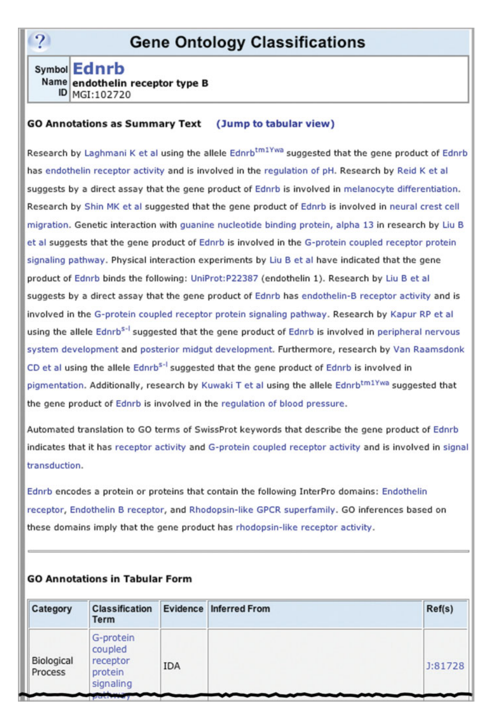
Figure 3. GO annotations as text. In response to user requests, we have created a lexicon and templates that enable computational generation of GO annotations in text form. This is provided to our web interface users in conjunction with the tabular presentation of the GO annotation information. Here, the GO text for gene Ednrb annotations is presented.