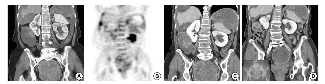
Fig. 1. Images before and after treatments. (A) A CT scan performed before systemic chemotherapy shows multiple metastatic masses in the abdomen and pelvis. (B) A PET scan performed before systemic chemotherapy shows multiple hypometabolic masses in the abdomen and pelvis. (C) A CT scan performed before radiotherapy and hormonal therapy shows multiple metastatic masses with increased size in the abdomen and pelvis. (D) A CT scan performed after radiotherapy and hormonal therapy shows a partial response to this therapy. The insert shows a radiotherapy planning radiography.

The patient received two cycles of systemic combination chemotherapy with paclitaxel (175 mg/m<sup>2</sup>) and carboplatin (AUC 5) every 3 weeks. However, the masses in the abdomen and pelvic cavity increased, resulting in difficulty in voiding and defecation (Fig. 1C). Finally, we tried debulking surgery,