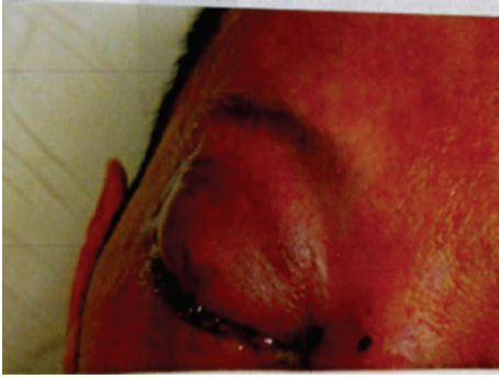
FIGURE 1: Right eye preseptal cellulitis showing severe chemosis with yellowish crust in the eyelids.