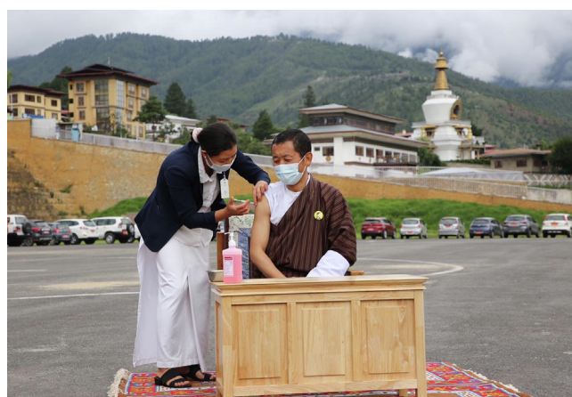
Fig. 1. The Prime Minister of Bhutan, Lyongchen (Dr.) Lotay Tshering receiving his second COVID-19 vaccine with Moderna's mRNA vaccine in Thimphu on 17 July 2021, three days ahead of the nationwide vaccine rollout, in order to boost public confidence in the “mix-and-match” strategy advocated by the government (Courtesy: Ministry of Health, Royal Government of Bhutan).

The US FDA and EMA authorized Pfizer-BioNTech's Comirnaty mRNA vaccine for use in children aged 5 to 11 years in October