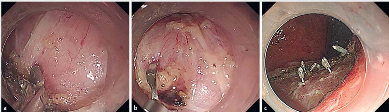
► Fig. 1 A modified search, coagulation, and clipping method for preventing delayed bleeding after gastric endoscopic submucosal dissection. a First, a coagulation procedure was done after lesion resection, mainly in the vessels at the margin of the ulcer base. b Perforator vessels may also be present in carbonized areas of the ulcer base. Clipping was also actively performed in such areas, which is the modification of the search, coagulation, and clipping approach. c The modified approach was completed.

Department of Gastroenterology, Kushiro Rosai Hospital, Kushiro, Japan