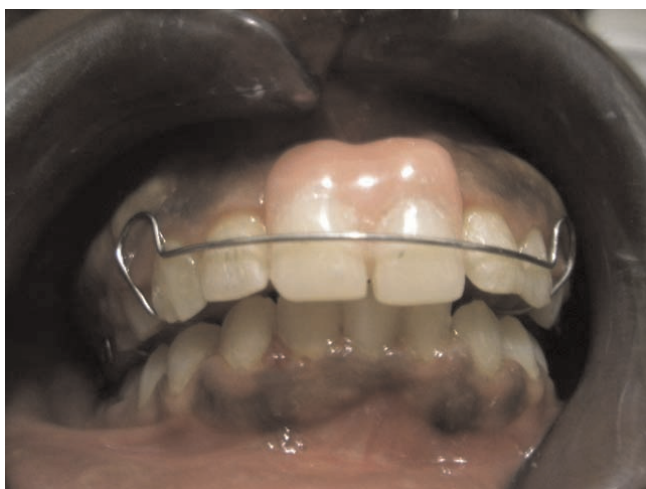
Figure 2. Clinical photograph of the patient at completion of treatment. Note the Hawley Retainer with stock teeth (maxillary central incisors) incorporated.

is when most injuries occur. It was reported that the most accident-prone age is between 8 and 10 years [12]. Local and international surveys reported that males experienced significantly more dental trauma to the permanent dentition than females [13]. In this case report, the patient is a male and is therefore more susceptible to trauma. Most boys also take part in contact sports and are more adventurous than females. Males were reported to be twice as often injured as girls with a ratio of 2.3:1 [12].