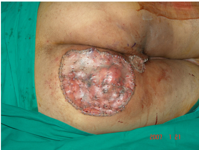
Figure 3 Intra-operative photo showing the defect created after total resection and split thickness meshed skin grafting.