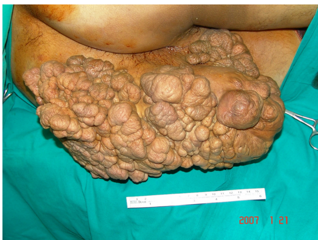
Figure 1 Intra-operative photo showing a large polypoidal mass involving most of the left gluteal and perianal area.

fied. The systemic clinical examination was within normal limits. Hematological and biochemical work-up including CBC, renal function, liver function and coagulation profile all showed normal results.